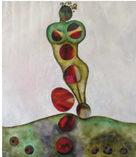
“Rolling Women” painting