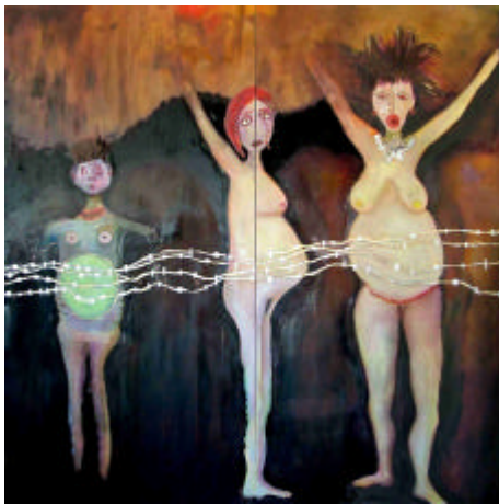
“Three Bad Mothers” painting