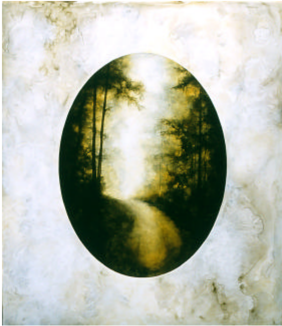
“Turning Point 2” Oil on panel