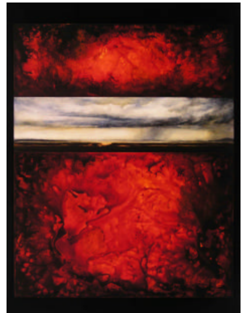
“Taos Gorge” Oil on panel

West Valley Art Museum is open 10 AM to 4 PM Tuesday through Sunday. The Museum is located at West Bell Road and 114th Avenue. With five exhibition galleries, a Museum Store, Classic Café , and regularly scheduled education programs, the Museum welcomes all visitors. There is a small admission charge for non-members. $7 adults, $2 students, ages 5 and under are free.