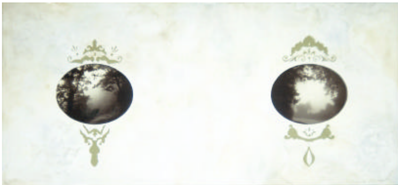
“Adam and Eve” Oil on panel