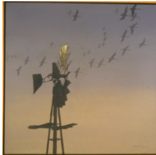
“Nebraska Dawn” By Robert Bateman

West Valley Art Museum is open 10 AM to 4 PM Tuesday through Sunday. The Museum is located at West Bell Road and 114th Avenue. With five exhibition galleries, a Museum Store, Classic Café , and regularly scheduled education programs, the Museum welcomes all visitors. There is a small admission charge for non-members. $7 adults, $2 students, ages 5 and under are free.