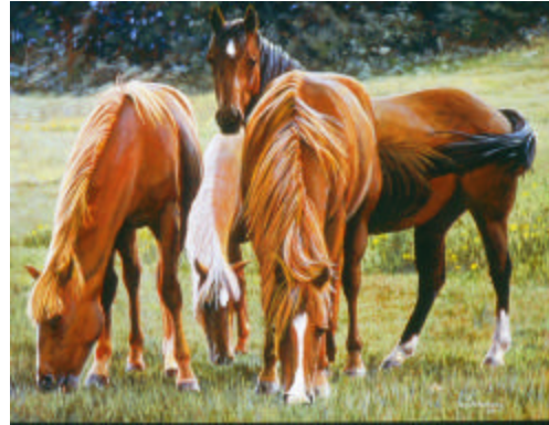
“Riding Horses” acrylic by tom Altenburg