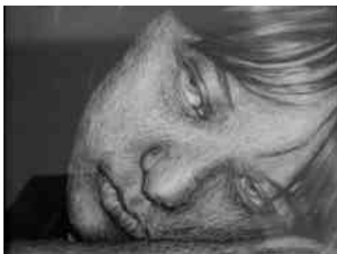
“Self Portrait” scratchboard by Miranda Todd, Peoria HS, grade 12

West Valley Art Museum is open 10 AM to 4 PM Tuesday through Sunday. The Museum is located at West Bell Road and 114th Avenue. With nine exhibition galleries, a Museum Store, and regularly scheduled education programs, the Museum welcomes all visitors. There is an admission charge for non-members. $7 adults, $2 students, ages 5 and under are free.