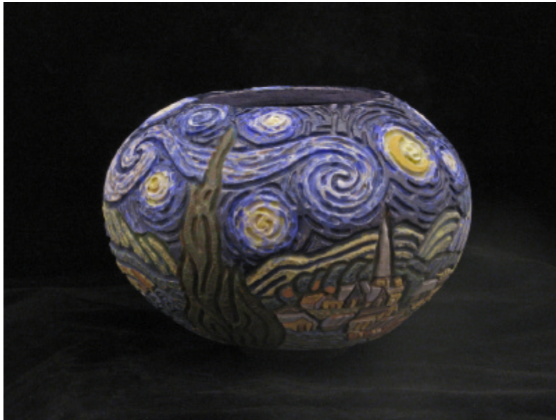
"My Starry Night" ceramic by April Watt

West Valley Art Museum is open 10 AM to 4 PM Tuesday through Sunday. The Museum is located at West Bell Road and 114th Avenue. With nine exhibition galleries, a Museum Store, and regularly scheduled education programs, the Museum welcomes all visitors. There is an admission charge for non-members. $7 adults, $2 students, ages 5 and under are free.